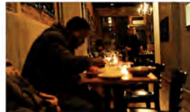
By LIGAYA MISHAN, Published: December 28, 2010